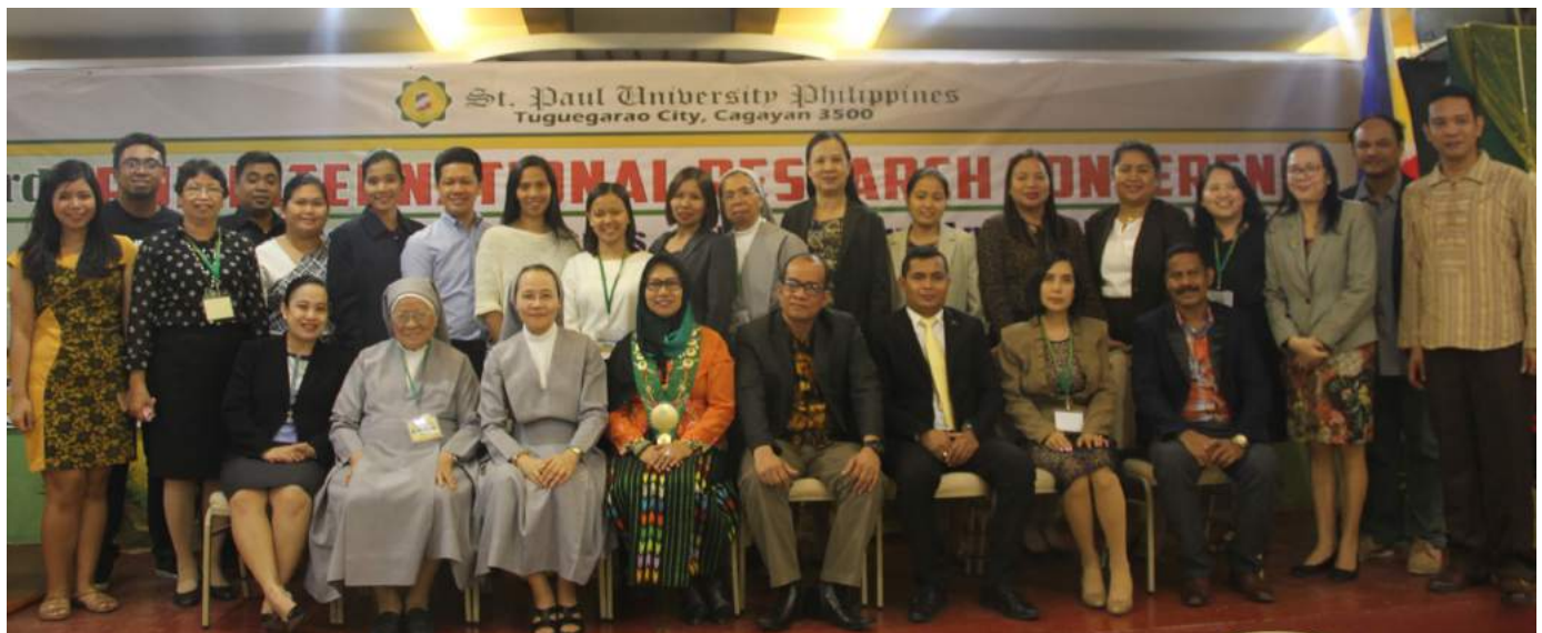
Image below: SPUP IRC3 Research Conference Organizers posing with the SPUP Administrators, Guests and Speakers.