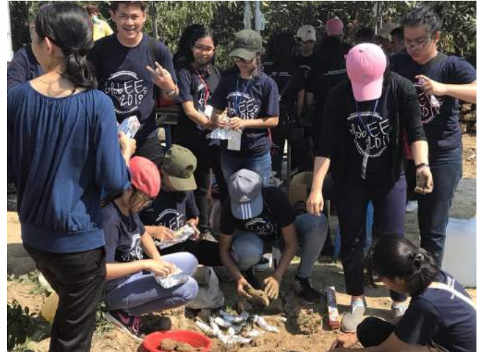
The Global Education Experiences (GlobEEs) 2018 Program students

All and all, GlobEEs 2018 has achieved its purpose with a well-balanced program between lecturers and hands-on activities to deal with the issues of Social Responsibility and Culture. It is now up to the alumni of GlobEEs 2018 to implement what they have learned and experienced during this two-week program in their lives to start becoming agents of change in society.