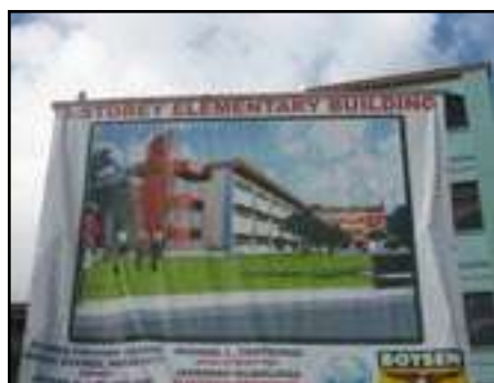
An architect's perspective is displayed at the building's site.

The construction of a Php 30 million, three-story Elementary Department building is underway and will be completed in October 2007. Filamer also offered new programs when the school year opened in June 2007, after it was recently granted a permit from the Philippine Commission on Higher Education (CHED). The new programs are B.S. Electronics