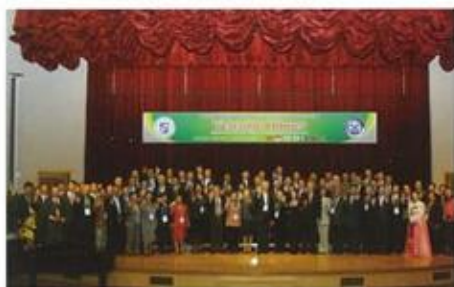
Participants at the Welcome Dinner

The 2010 ACUCA Biennial Conference and 18th General Assembly took place at Keimyung University, November 1-3, 2010. The following are a selection of images taken throughout the Conference.