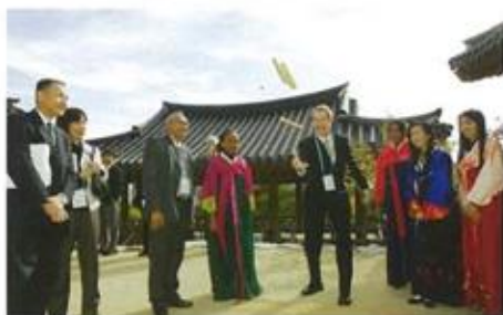
Korean Culture Experience at Keimyung's Hanhakchon