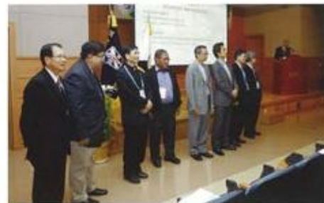
Election of New Executive Committee Officers