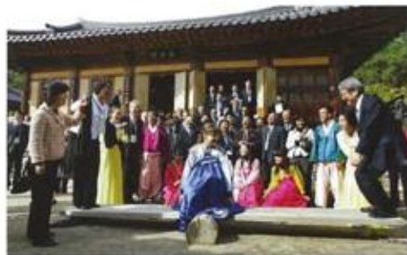
Korean Culture Experience at Keimyung's Hanhakchon