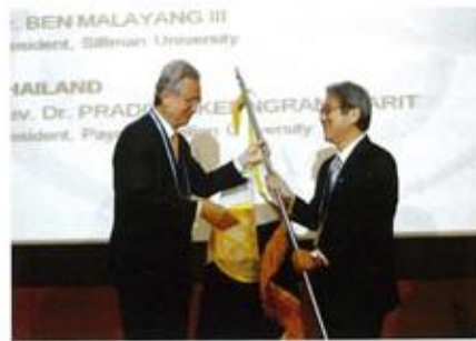
Transfer of ACUCA Secretariat to ICU