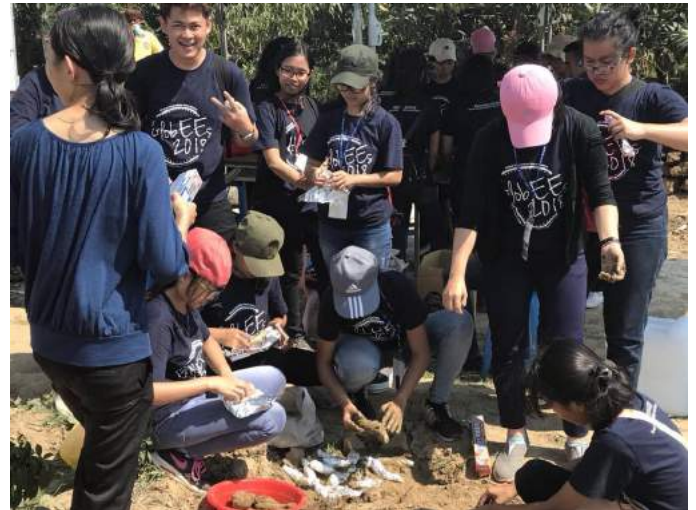
The Global Education Experiences (GlobEEs) 2018 Program students

All and all, GlobEEs 2018 has achieved its purpose with a well-balanced program between lecturers and hands-on activities to deal with the issues of Social Responsibility and Culture. It is now up to the alumni of GlobEEs 2018 to implement what they have learned and experienced during this two-week program in their lives to start becoming agents of change in society.