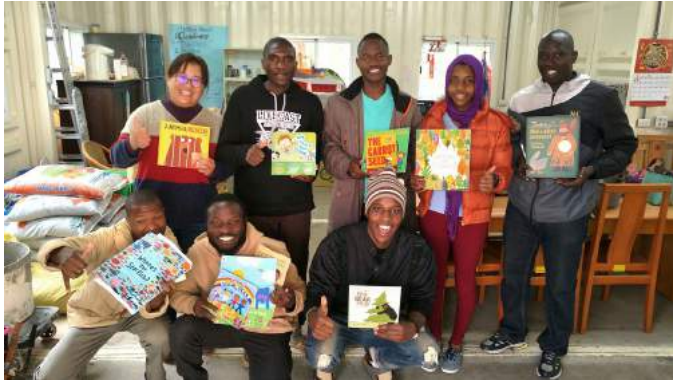
IPSD students attending campus activity.

Founded in 1993, Chang Jung Christian University (CJCU), Taiwan, is committed to providing holistic pastoring education and sustainable development. In 2016, in cooperation with Jane Goodall Institution, CJCU planned to offer the International Program for Sustainable Development (IPSD), a 4-year bachelor degree program. This program aims to equip students with interdisciplinary knowledge of environment sustainability, civil action, international affairs, and cultural diversity. In 2017, the program successfully recruited around 20 international students, mostly from Africa to teach and to solve the multicultural and ecological challenges in Taiwan.