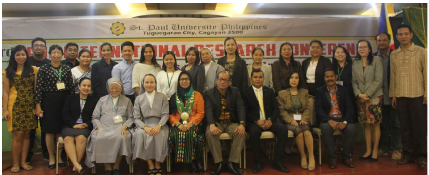
Image below: SPUP IRC3 Research Conference Organizers posing with the SPUP Administrators, Guests and Speakers.