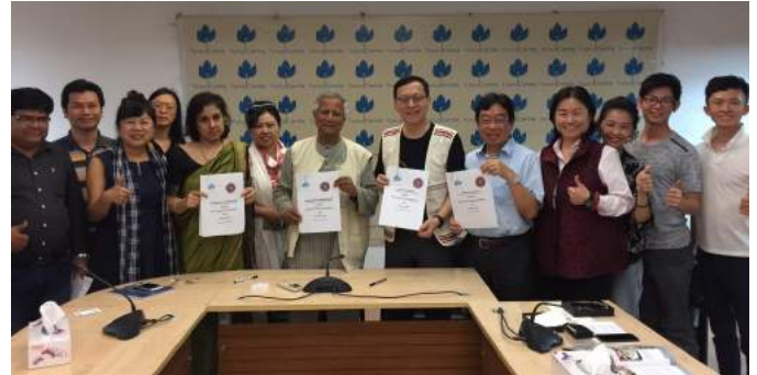
CJCU and Yunus Centre signed a MOU at Dhaka, India.

Center would lecture for all student participants on social responsibility and related topics to prepare young generations for social business conception and innovation.