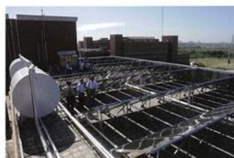
Solar system installed on the roof of student dormitory.