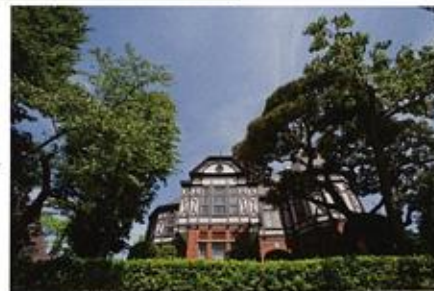
The campus of Meiji Gakuin University in central Tokyo