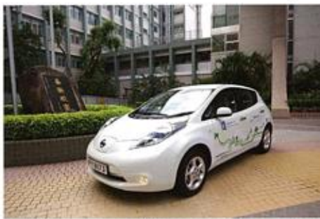
HKBU purchases a 100 per cent electric-powered vehicle with zero roadside emission as one of its green initiatives.