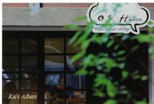
The friendly narrative space in Tunghai campus.