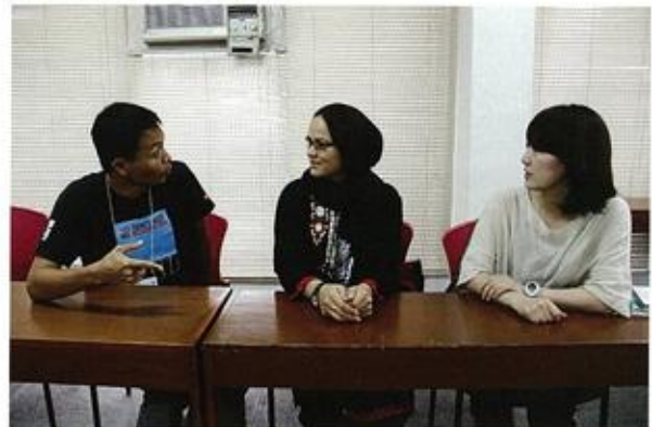
Asia Leaders Program (Year 6) students engaging in a class discussion at the Ateneo Language Learning Center

https://www.facebook.com/pages/UPEACE-Asia-Leaders-Programme/137398506279483