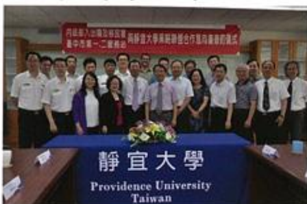
Signing ceremony at Providence University

For Providence University, building an internationalized learning environment is the crucial goal. With the support from NIA, PU becomes more proficient in helping the students and professors from overseas with their visas, especially. As a Catholic university, Providence is committed to contribute to society and care for the needy. Through the alliance with NIA, students and professors in PU can apply their expertise and provide professional assistance to international students and immigrants in the areas such as communication, counseling, advocacy and education. For example, the professors of Department of Cosmetic Science have recently been teaching the method of making soap and essential oil for immigrants in order to equip them to develop employability skills. In addition to the efforts contributed by faculty, NIA also encouraged PU students who are interested in the service of new immigrants to take internship at NIA or civil examination so that they will learn practical ways to serve immigrants and international students through government-university collaboration.