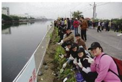
Students participated in a tree-planting activity by the ChiaNan Channel in Tainan.

Since its founding, CJCU has sought to incorporate sustainability into its core values and make it a key feature of our institutional identity and Christian witness. We therefore welcome the MOE's challenge to make sustainability a basic paradigm for higher education in Taiwan.