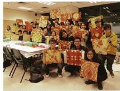
Students learn about the damage to the environment resulting from the production of clothing and try a natural dyeing method at a workshop.