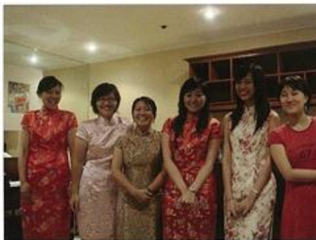
Wenzao students joined the 2007 ASEACCU conference for students in Philippines.