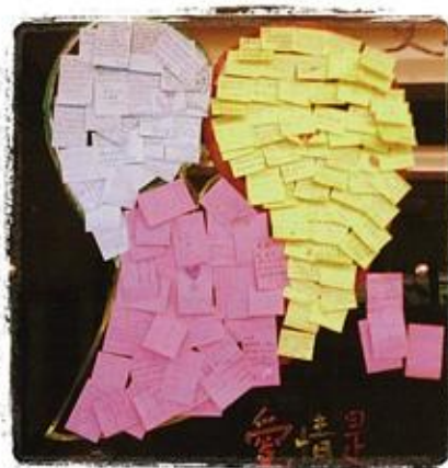
The monthly activity in OS House "Love in your life"

With these values within this petite space in such a gigantic campus, we wish to transform "our stories" into "our story." Hopefully, in a future which is not too distant, we may see both individuality and unity under HlStory at Tunghai.