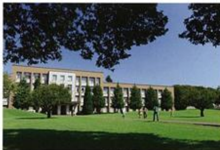
The green and spacious campus of International Christian University

The deadline for registration is September 12.