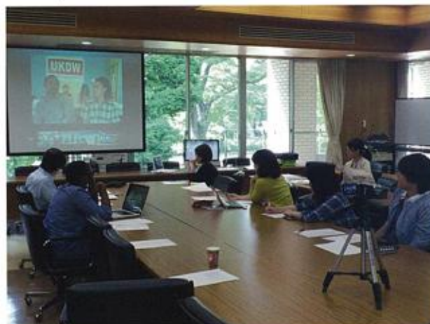
Video conferencing on June 4 at International Christian University

A part of the participants will be invited to the Wrap-up Seminar which will take place before the ACUCA Student Camp at International Christian University in mid August. The participants, whose airfare will be granted by the UBCHEA, are expected to exchange their opinions through face-to-face communication and will report their learning outcome during a session of the Student Camp.