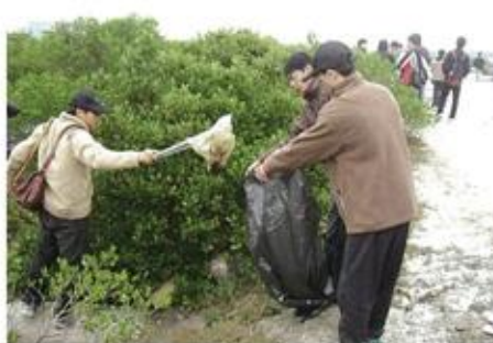
Students cleanup trash in wetland of Tainan City SihCao Wildlife Refuge.