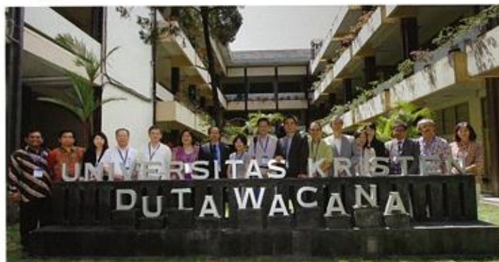
The Executive Committee members at Duta Wacana Christian University