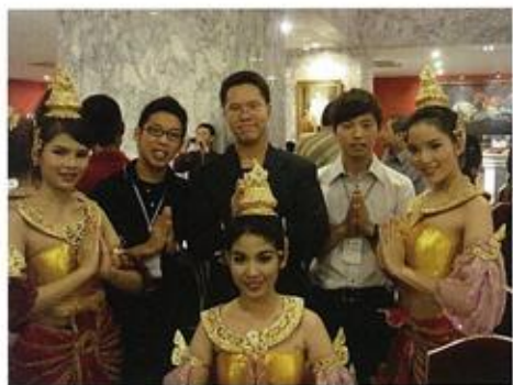
Wenzao students joined the cultural night 2010 ASEACCU conference for students in Thailand.