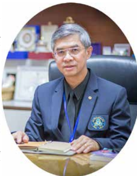
Photo: ACUCA Management Conference 2017 Luce Chapel, Payap University, Thailand