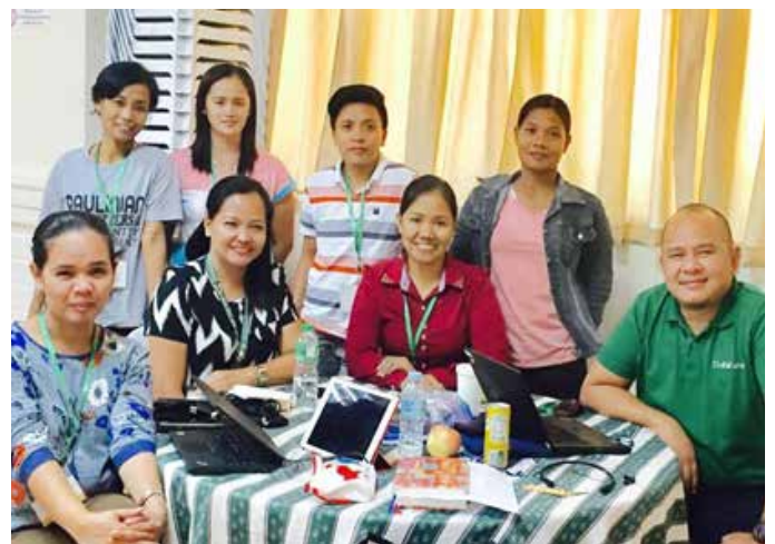
Photos of Trainers and participants of SPUP-CDCFI-ChildFund Phil Project Management Training Seminar held on Oct. 24-26, 2017.

The training seminar afforded the participants increased knowledge, appreciation and services of Sponsorship Management of the Child Protection Program.