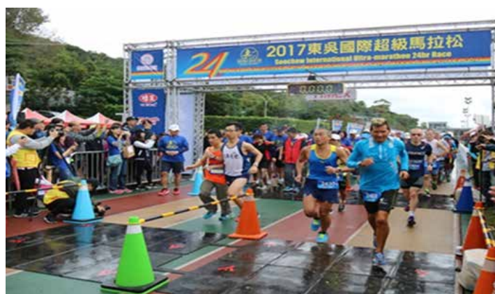
A great start in the Soochow Ultra-marathon.