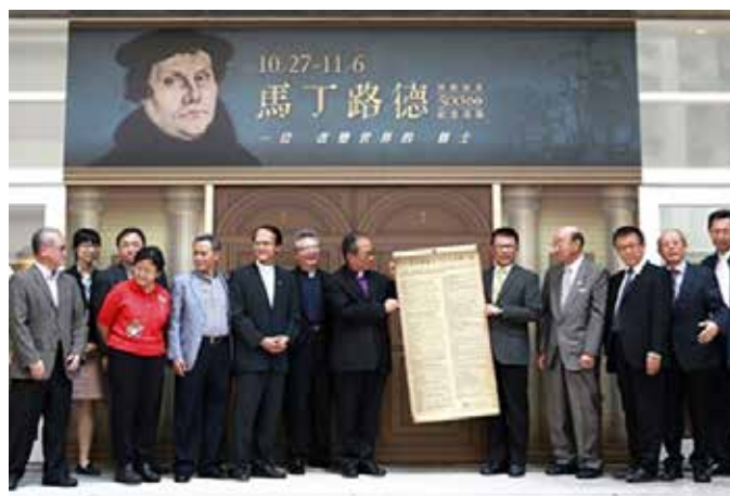
Commemoration of Martin Luther on Soochow University campus began with posting of the "95 Theses", 27 October 2017

The Year 2017 is a significant milestone in human history as it marks the 500th anniversary of Martin Luther's religious reformation – a time for people to look back on history and introspect. May the world continue to carry forward the spirit of the Reformation, stride ahead with dauntless heart, and embrace challenges with no fear!