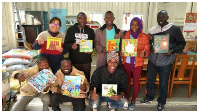
IPSD students attending campus activity.

Founded in 1993, Chang Jung Christian University (CJCU), Taiwan, is committed to providing holistic pastoring education and sustainable development. In 2016, in cooperation with Jane Goodall Institution, CJCU planned to offer the International Program for Sustainable Development (IPSD), a 4-year bachelor degree program. This program aims to equip students with interdisciplinary knowledge of environment sustainability, civil action, international affairs, and cultural diversity. In 2017, the program successfully recruited around 20 international students, mostly from Africa to teach and to solve the multicultural and ecological challenges in Taiwan.