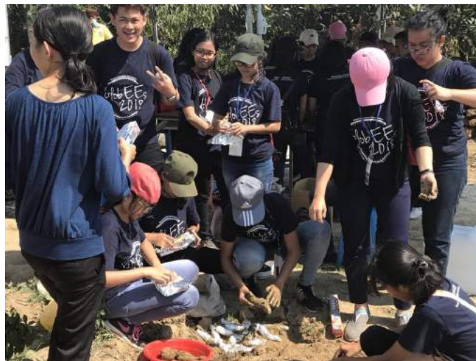
The Global Education Experiences (GlobEEs) 2018 Program students

All and all, GlobEEs 2018 has achieved its purpose with a well-balanced program between lecturers and hands-on activities to deal with the issues of Social Responsibility and Culture. It is now up to the alumni of GlobEEs 2018 to implement what they have learned and experienced during this two-week program in their lives to start becoming agents of change in society.