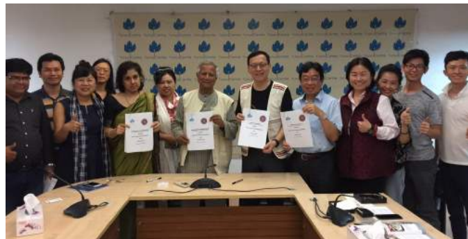
CJCU and Yunus Centre signed a MOU at Dhaka, India.

Center would lecture for all student participants on social responsibility and related topics to prepare young generations for social business conception and innovation.