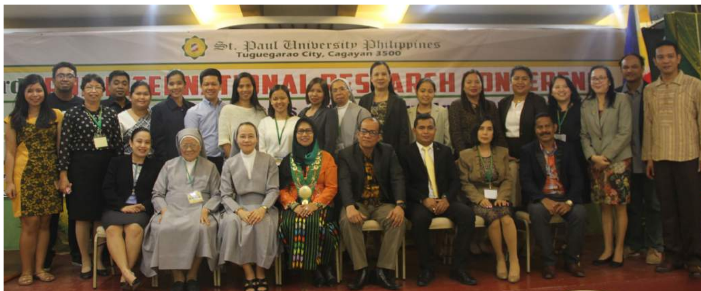
Image below: SPUP IRC3 Research Conference Organizers posing with the SPUP Administrators, Guests and Speakers.