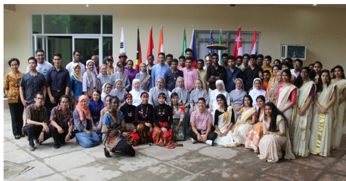
Payap University, Thailand

SPUP international students in their colorful national costumes, together with the Sisters and lay administrators, posing for posterity.