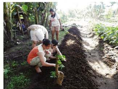
Vegetable gardening is among the activities that the participants are encouraged to experience.