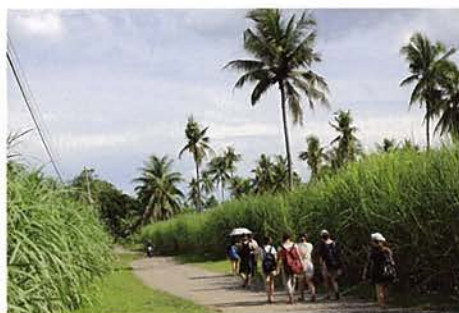
Sometimes walking back to one of the host sites, a housing project, proves to be more fun.