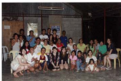
S-L participants taking a pose with their host families and some barangay officials inside a multipurpose area after an orientation session.

Silliman's active involvement in service-learning was nurtured with the support of the United Board for Christian Higher Education in Asia. It also derived impetus from its involvement in the Service-Learning Asia Network organized by International Christian University in Tokyo, Japan.