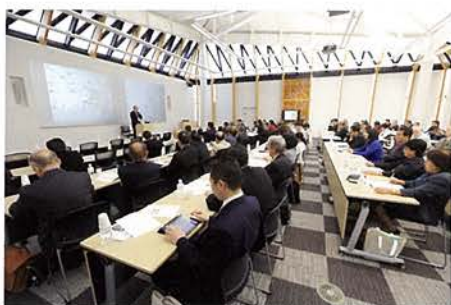
Keynote lectures took place at the Dialogue House at ICU.