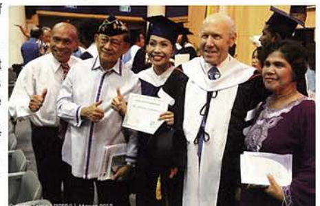
The graduates pose with Former Philippine President Fidel V. Ramos who is part of the Asia Leaders Programme International Advisory Board.