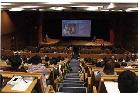
Many students attended the lecture.