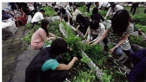
Staff members enjoy organic farming on the rooftop gardens on campus.

The Sustainable Low Carbon Campus project achieved excellent results by 2012. The University has achieved a 5% carbon reduction, which is equivalent to 1,000 tonnes of carbon emissions that would require 43,000 mature trees to be absorbed in one year. These impressive achievements resulted in the University winning the Silver Award in the Public Organisations and Utilities Category at the 2011 Hong Kong Awards for Environmental Excellence and being awarded the "Class of Excellence" Wastewi$e Label two years in a row.