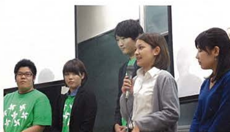
Students making a presentation on the ACUCA Network Model.