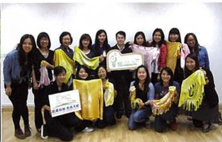
HKBU Staff enjoy eco-friendly tie-dyeing at a BU1300 workshop, during a lunchtime activity.