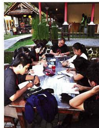
SLP participants in the midst of a group reflection.