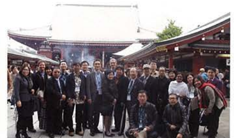
Participants enjoyed their visits to Asakusa during the optional half day tour.