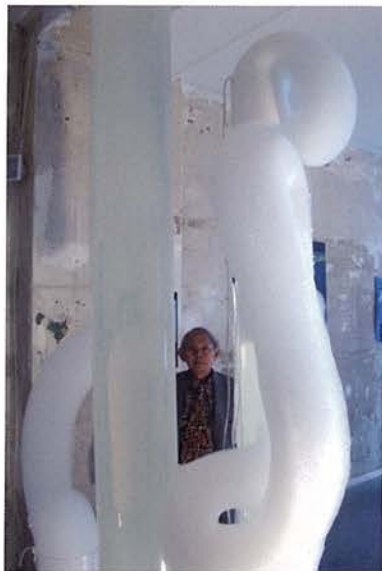
Artist David Medalla in one of his creations "Cloud Canyons." Cloud Canyons are considered to be an iconic work of twentieth century art.