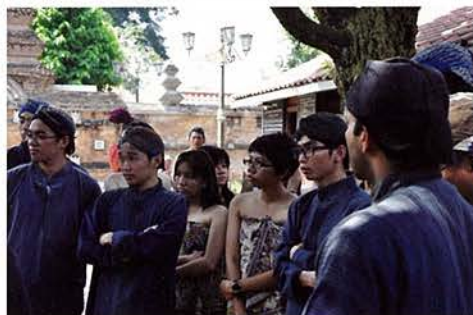
SLP participants during the visit to the Royal Tomb and its surrounding Moslem community in Kotagede.

In 2013, SLP will be held in Naga, the Philippines with Ateneo de Naga University acting as the host. USD is a routine participant in SLP and intends to send participants to attend the next SLP.