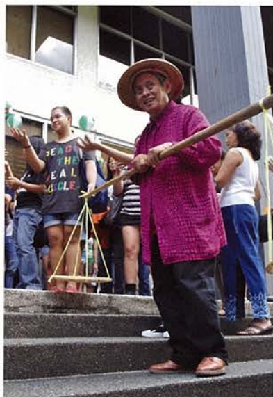
David Medalla performs at the Vargas Museum in University of the Philippines.