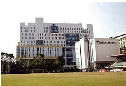
Newly completed Academic and Administration Building and the Madam Kwok Chung Bo Fun Sports and Cultural Centre.

The new buildings form part of the University's Campus Expansion Plan which will increase the net floor area of the campus by 27,000 sq m on its completion in 2013.