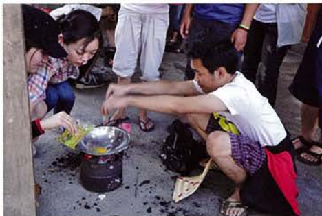
Members of a group collaborating to cook their own dinner during the second phase of SLP.