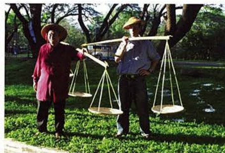
Another performance at the Vargas Museum.