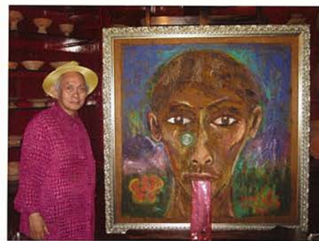
David Medalla with his portrait.