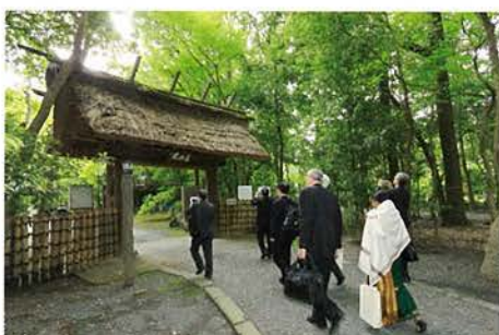
Participants visiting Taizan-so, a historic house in the Japanese Garden on ICU campus.