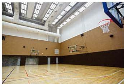
The sports hall has a ceiling height of 12 m.