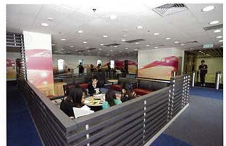
Highly popular among students, the Learning Commons has two separate zones for group discussion and private study.