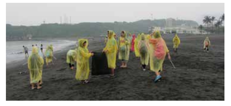
Wenzao students participating in sea and beach purification

Wezao has continuously advocating power saving and carbon dioxide reduction by controlling the consumption of electric power and water. The consumption of electricity in 2013 was 19.72% less than that in 2008. On the other hand, the consumption of water in 2014 was 31.2% less than that in 2008. The achievement has been recognized by the Kaohsiung City Government' s Best Fuel-saving Award and twice approved as one of the excellent (non-profit) organization for its initial inspection by the Bureau of Energy, Ministry of Economic Affairs. Wenzao' s efforts on campus sustainability have been recognized by GUUT to be invited as a formal member. In the future, Wenzao will continue to be an advocate by taking actions to promote environmental sustainability through integrations of curriculums that reflect the value of a university.