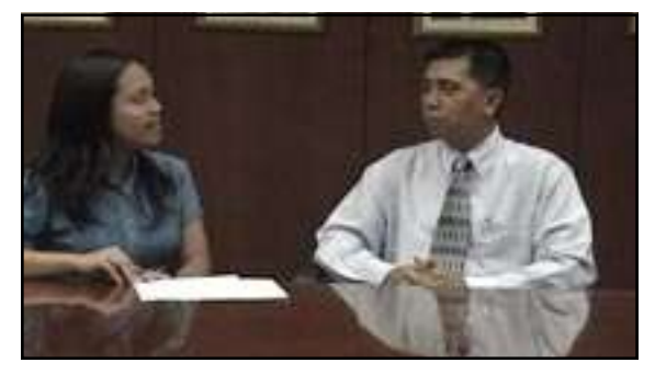
CPU administrator responds to questions during the Quality Management System audit.

Central Philippine University (CPU) in Iloilo, Philippines was recommended for continued certification for ISO 9001 version 2000 (Quality Management System) after it was reassessed on May 9-10, 2007. CPU has been certified for this standard for the past three years.