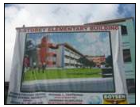
An architect's perspective is displayed at the building's site.

The construction of a Php 30 million, three-story Elementary Department building is underway and will be completed in October 2007. Filamer also offered new programs when the school year opened in June 2007, after it was recently granted a permit from the Philippine Commission on Higher Education (CHED). The new programs are B.S. Electronics