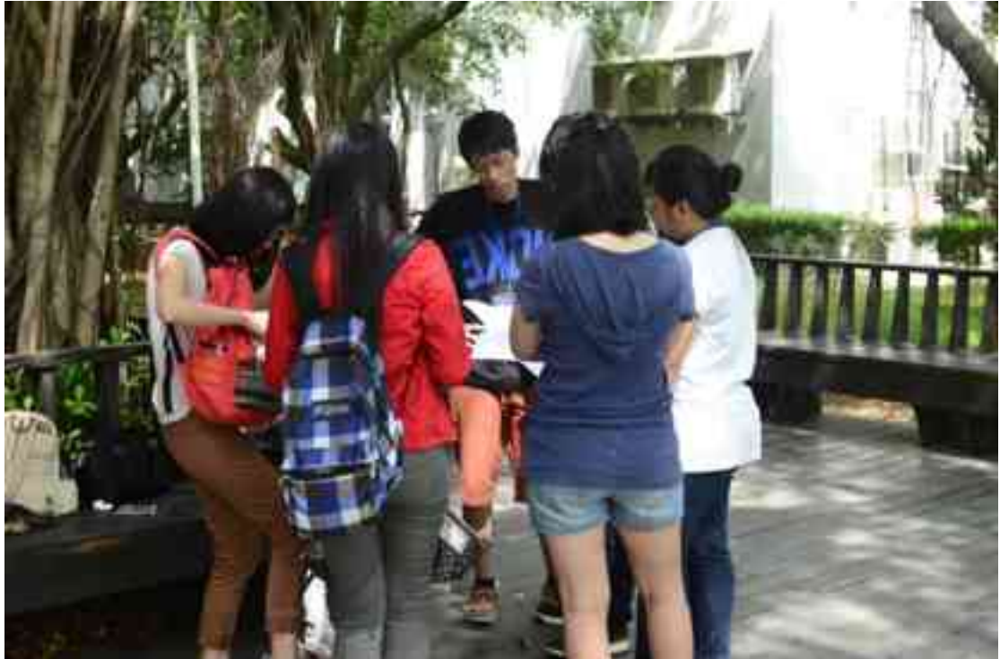
Synthesis: Values in Action